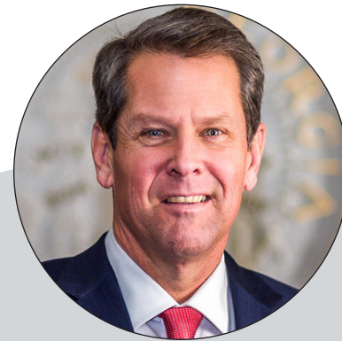
BRIAN KEMP Governor of Georgia